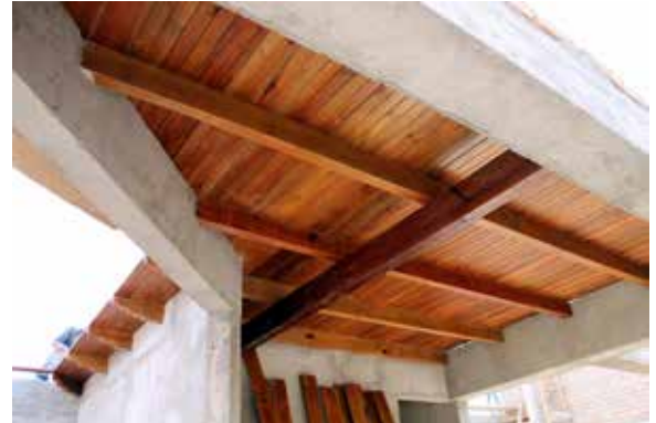
This is the first ceiling to be put in place in the house. We are using wood beadboard to reflect the beautiful Spanish colonial style of Honduras' origins.