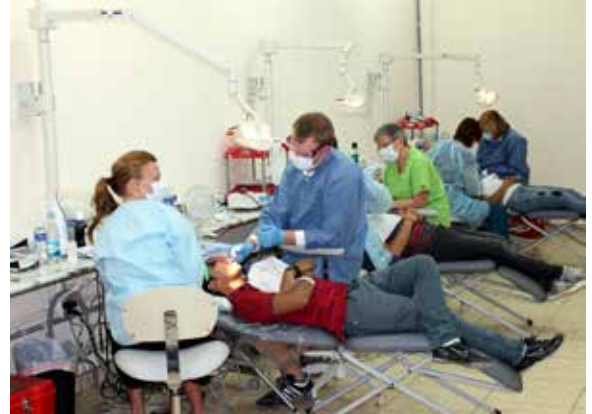
Above, the hygienists hard at work in their section of the Villa Linda Miller clinic!